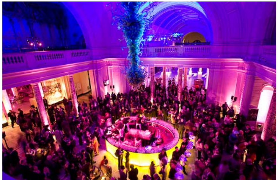
Pictured: Delegates at the opening ceremony of the Going Global conference

"We believe that there's a change happening. We believe that we're moving from a classic model of institutional learning with pre-defined