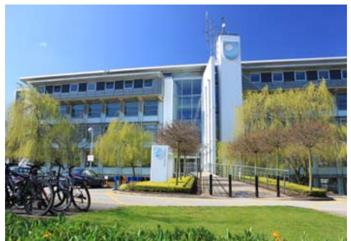
Pictured: The Berrill Building on The Open University campus, UK.

Expert advice on how to run workshops, write course material and establish distance learning organisations. Areas of guidance include quality assurance, strategy and management, learning support, teacher education and computing.