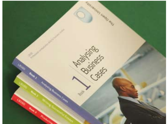
Pictured: Course books from LB160, Professional communication skills for business studies.