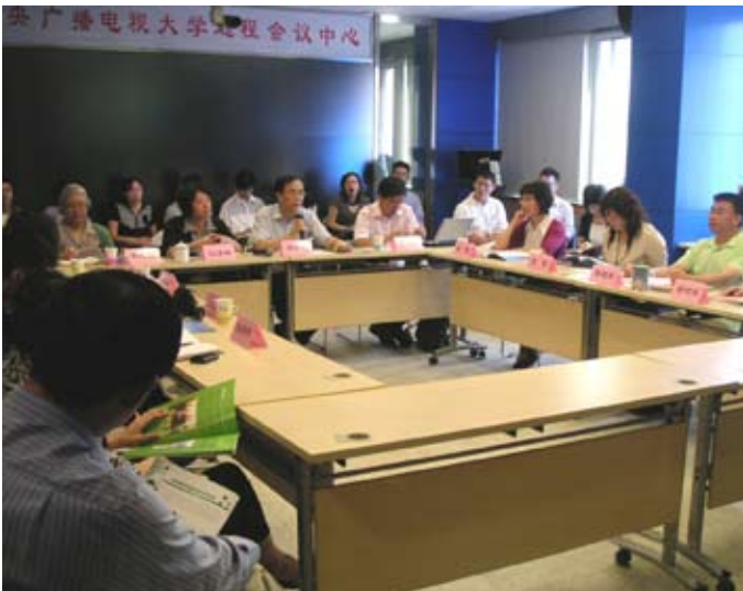
Pictured: The launch ceremony for OUC's new courses

In addition to the 10th anniversary conference reported on page two, The Open University of China (formerly China Central Radio and Television University, or CCRTVU) hosted an International Summit of Open and Distance Education in Beijing during October. The conference not only marked The Open University of China's (OUC) 30th anniversary, but also saw the launch of three online courses, provided in collaboration with The Open University.