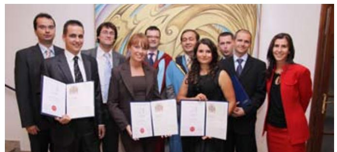
Pictured: OMI award ceremony in Bratislava