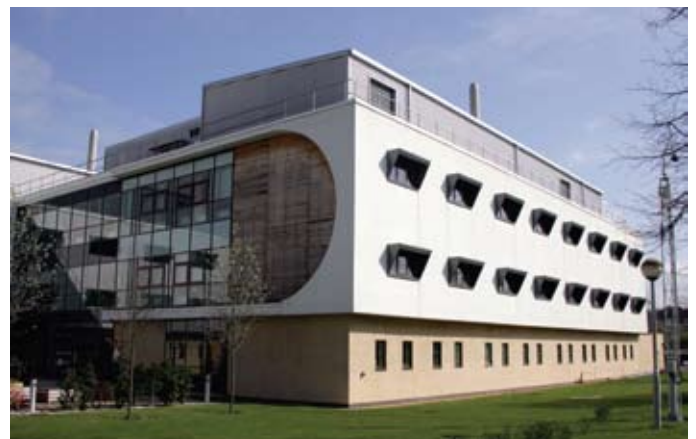
Pictured: The Robert Hooke Building on The Open University campus, UK, home to the Science Faculty, the Planetary and Space Science Research Institute and the Department of Chemistry and Analytical Sciences.